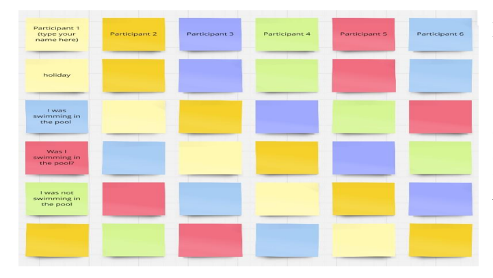
Figure 2. Writing practice activity in Miro interactive digital board.

Supportive and cooperative learning is crucial for nurturing an interest in writing in the target language and facilitating students' language development (Caswell, 2004). This entails establishing an environment in which students feel at ease to engage in experimentation, express their thoughts, and receive useful feedback. Collaborative activities such as peer evaluation, group brainstorming, and project writing, composing presentation slides promote collaborative learning among students and develop communicative competence during the writing process.